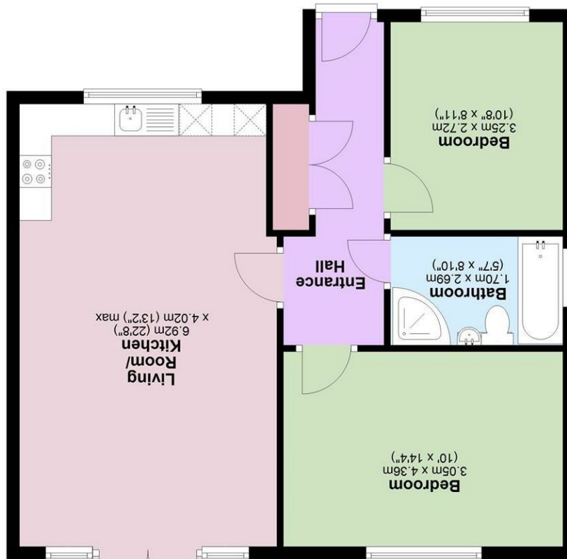
Detached Bungalow Approx: 63.8 sq. metres (686.2 sq. feet)

Total area: approx. 63.8 sq. metres (686.2 sq. feet)