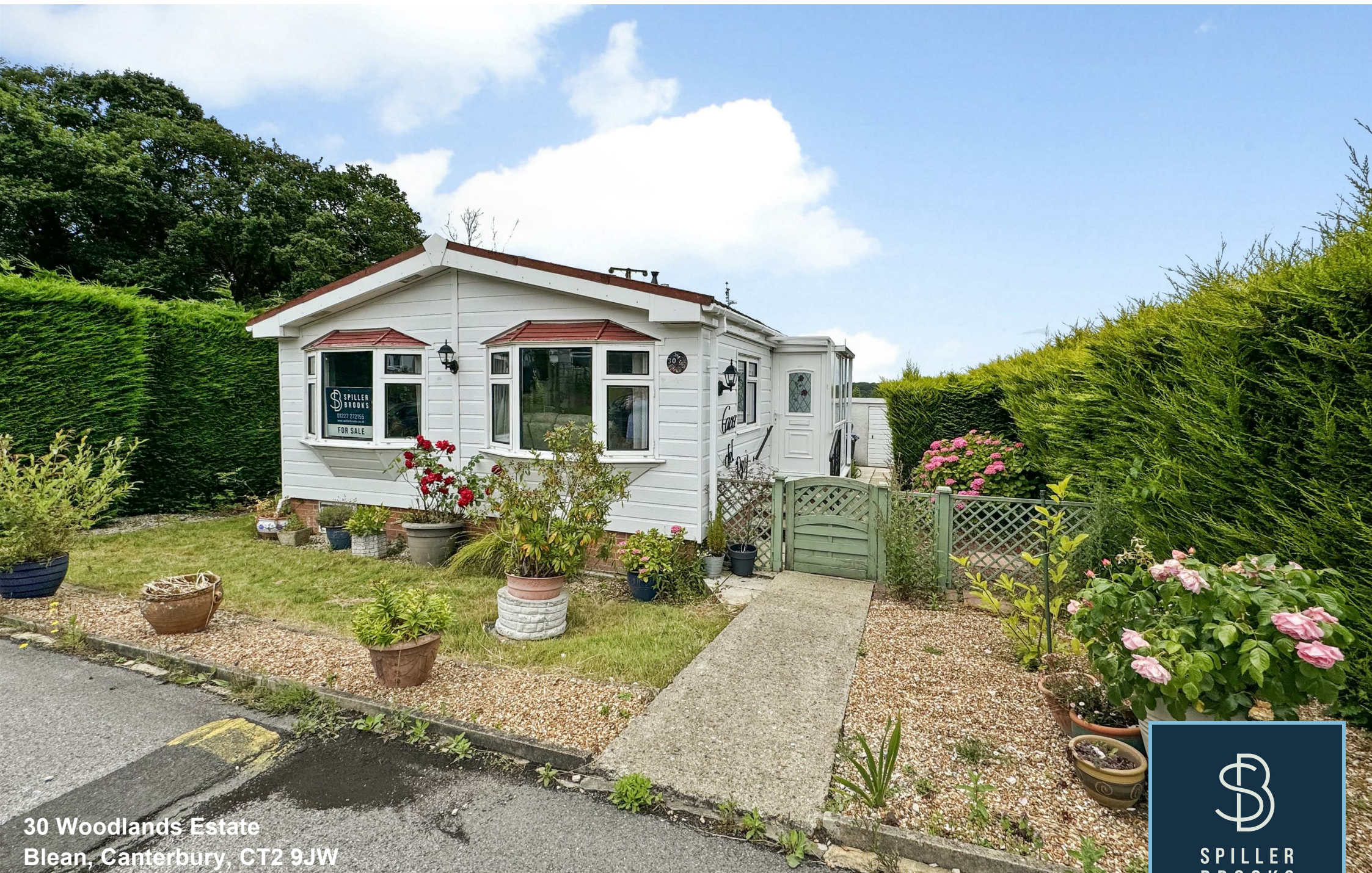
30 Woodlands Estate Blean, Canterbury, CT2 9JW