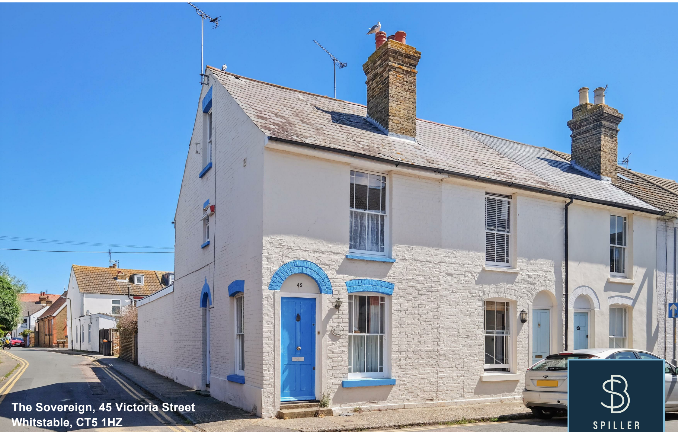
The Sovereign, 45 Victoria Street Whitstable, CT5 1HZ