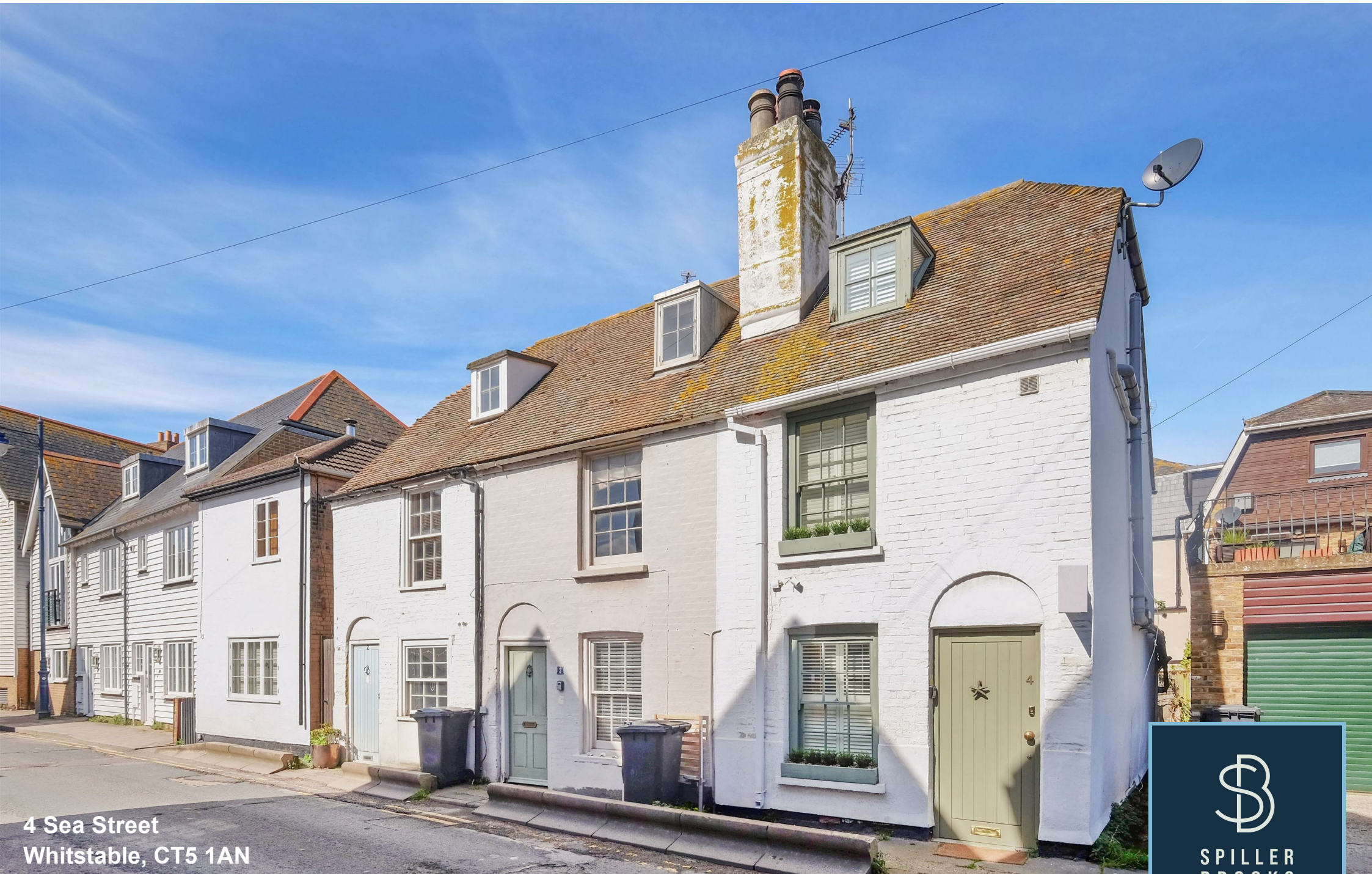
4 Sea Street Whitstable, CT5 1AN