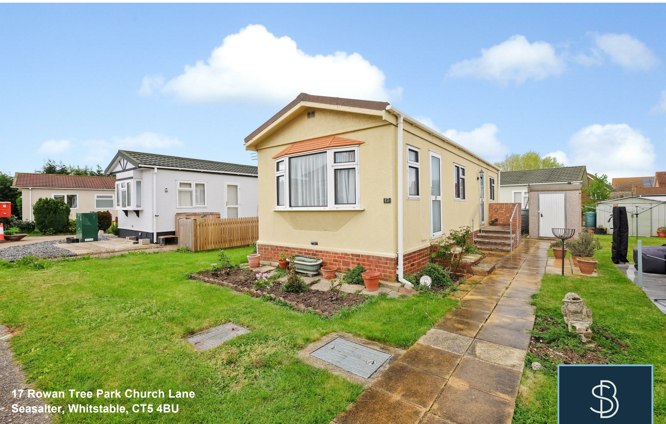
17 Rowan Tree Park Church Lane Seasalter, Whitstable, CT5 4BU