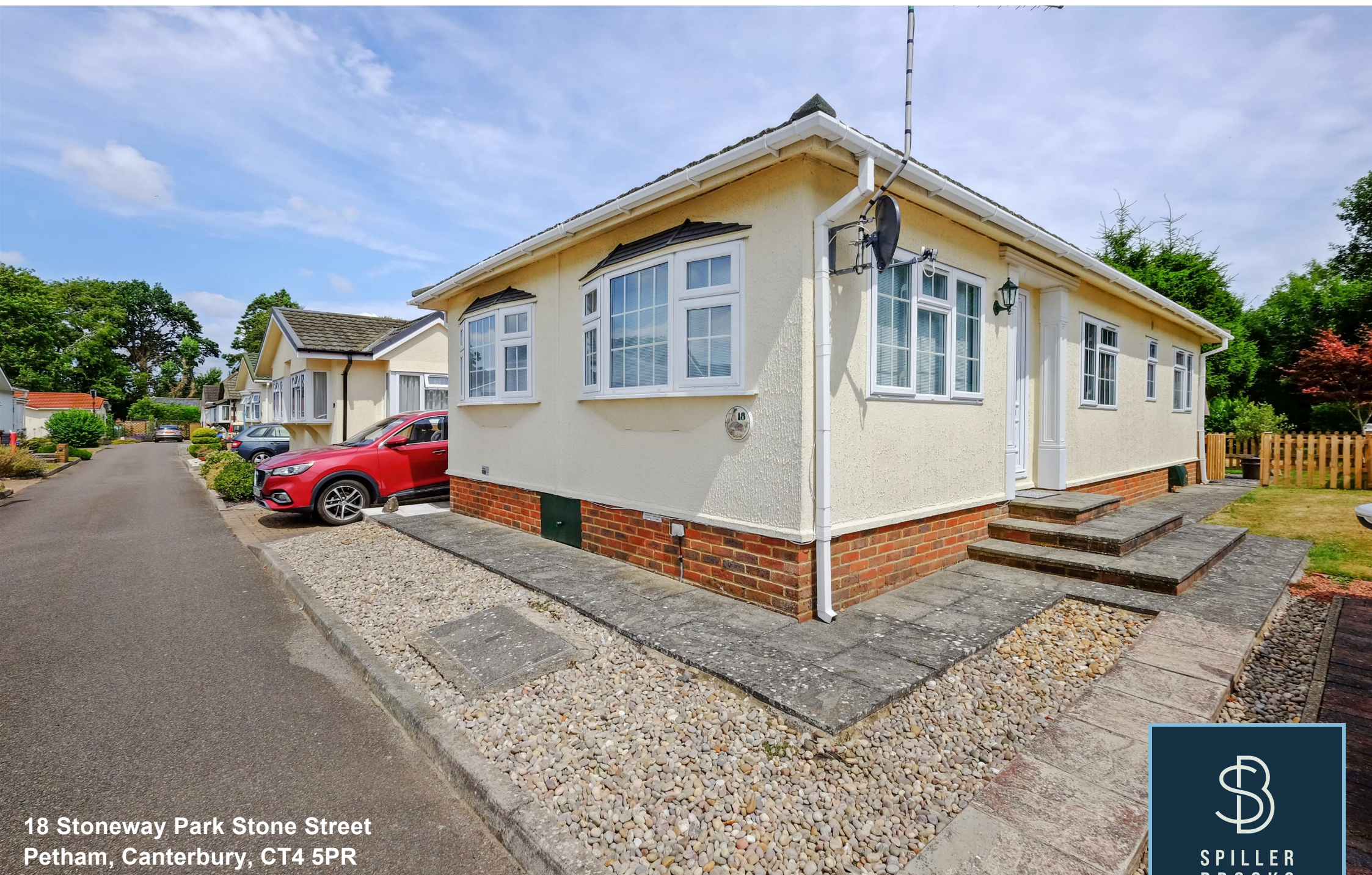
18 Stoneway Park Stone Street Petham, Canterbury, CT4 5PR