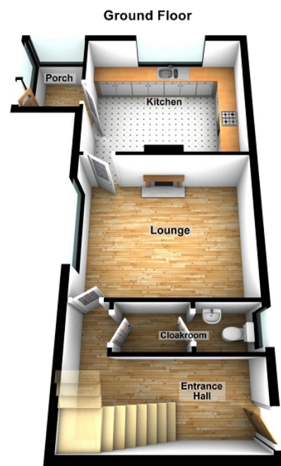
This floorplan is approximate only Plan produced using PlanUp.