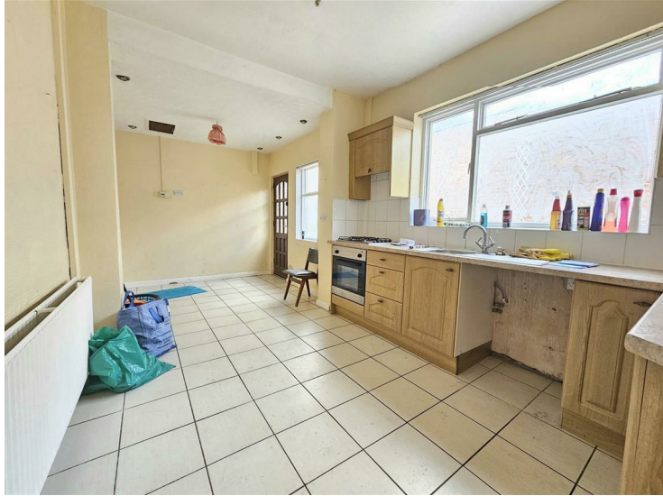
Breakfast Kitchen 19'8" x 8'5" (6 x 2.57)