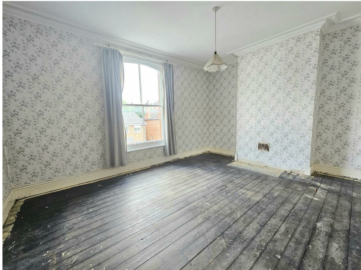
Bedroom One 12'3" x 14'5" (3.74 x 4.41)