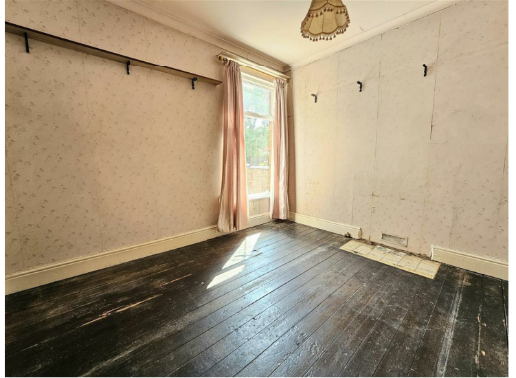
Bedroom Two 12'2" x 11'1" (3.72 x 3.4)