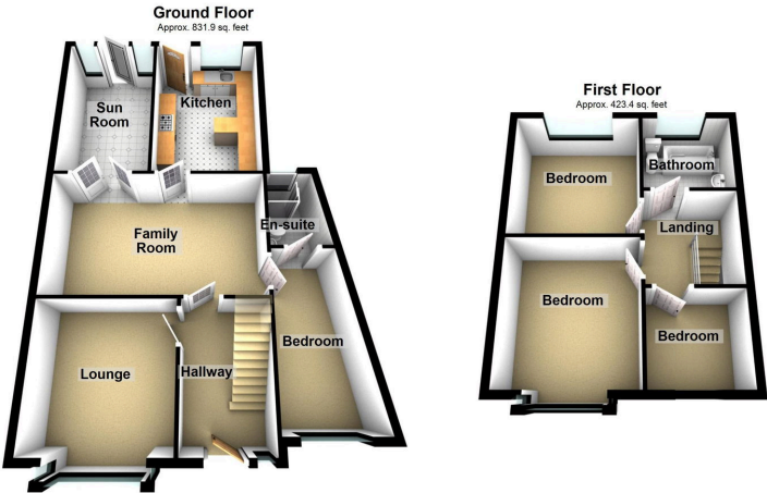
Total area: approx. 1255.3 sq. feet