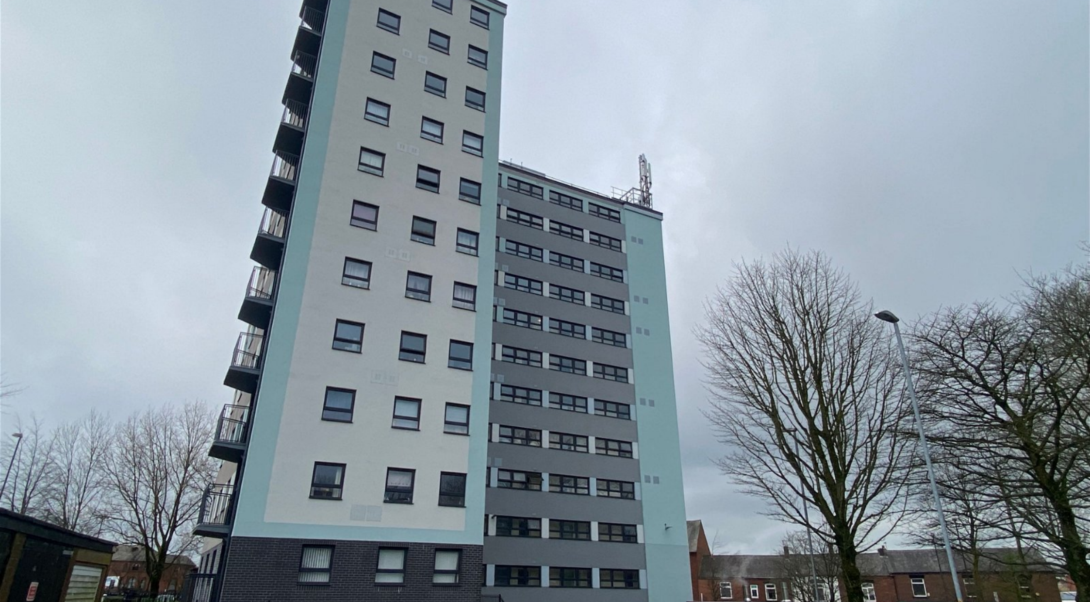
Littlemoor House, Huddersfield Road, Oldham