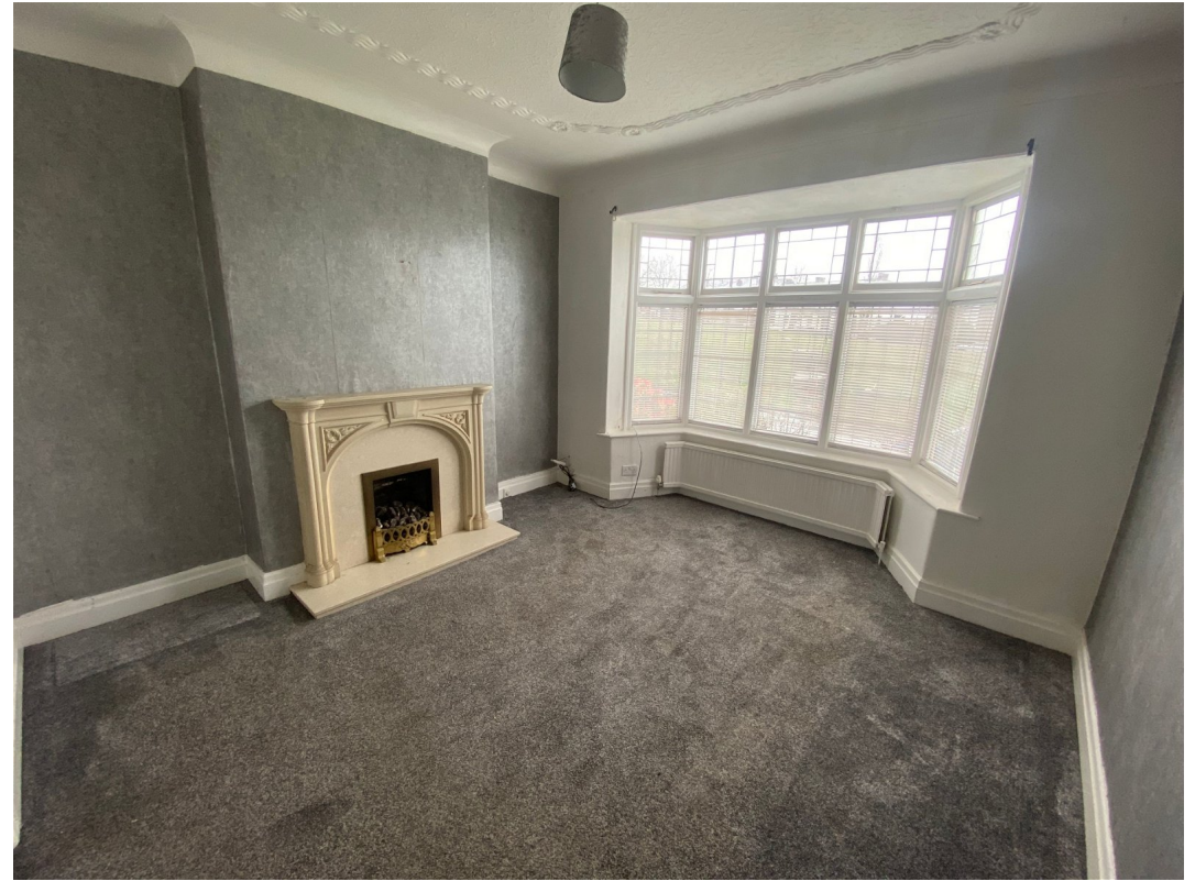
Dewhirst Road, Rochdale