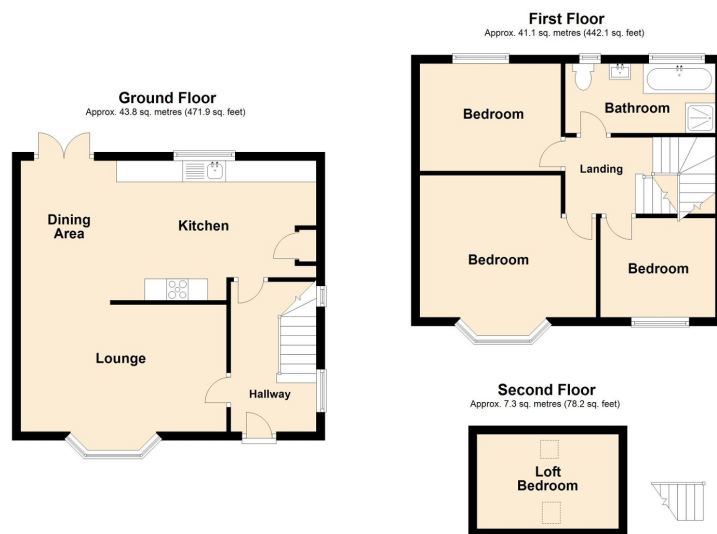
Total area: approx. 92.2 sq. metres (992.2 sq. feet)