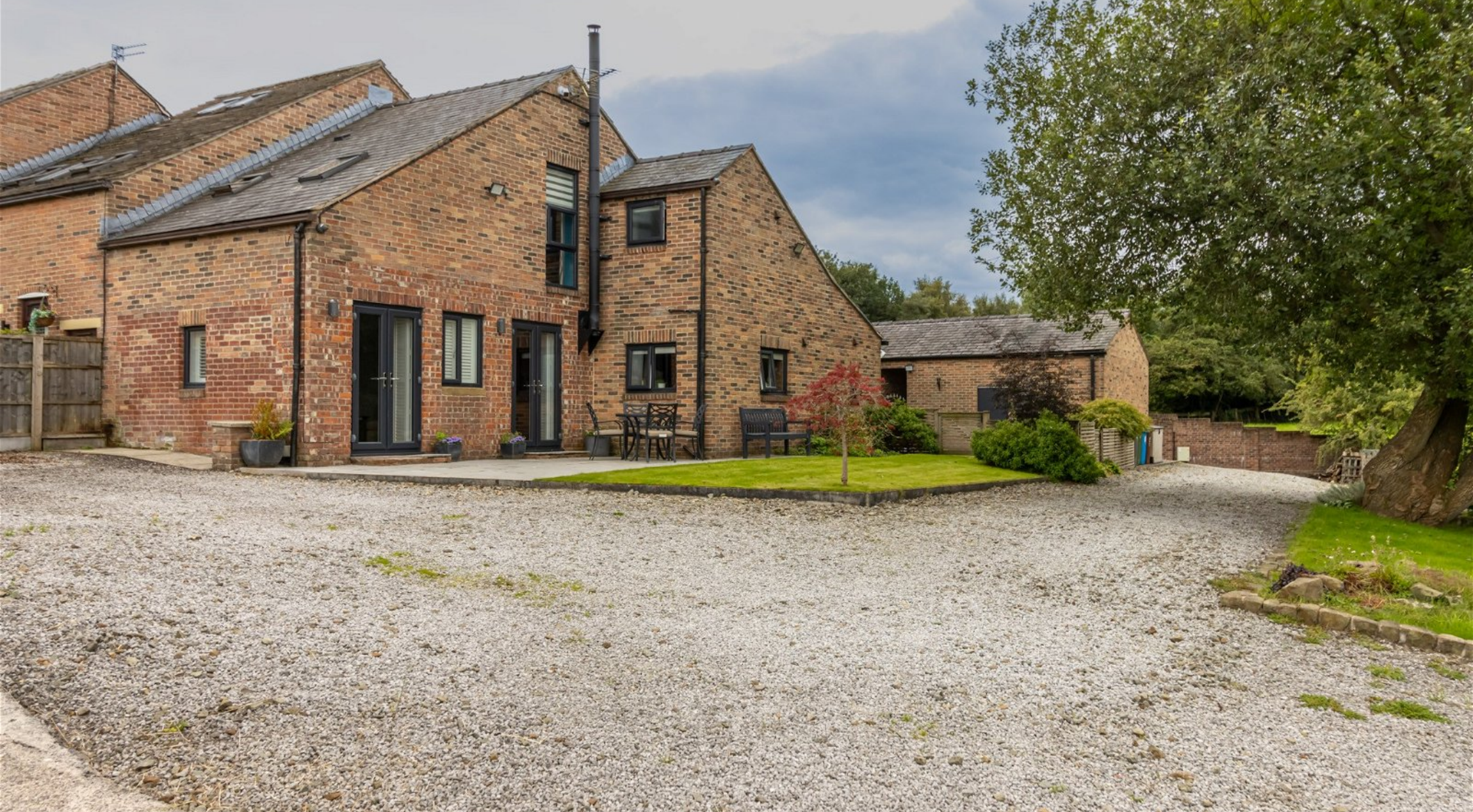
Ferney Field House Farm, Chadderton