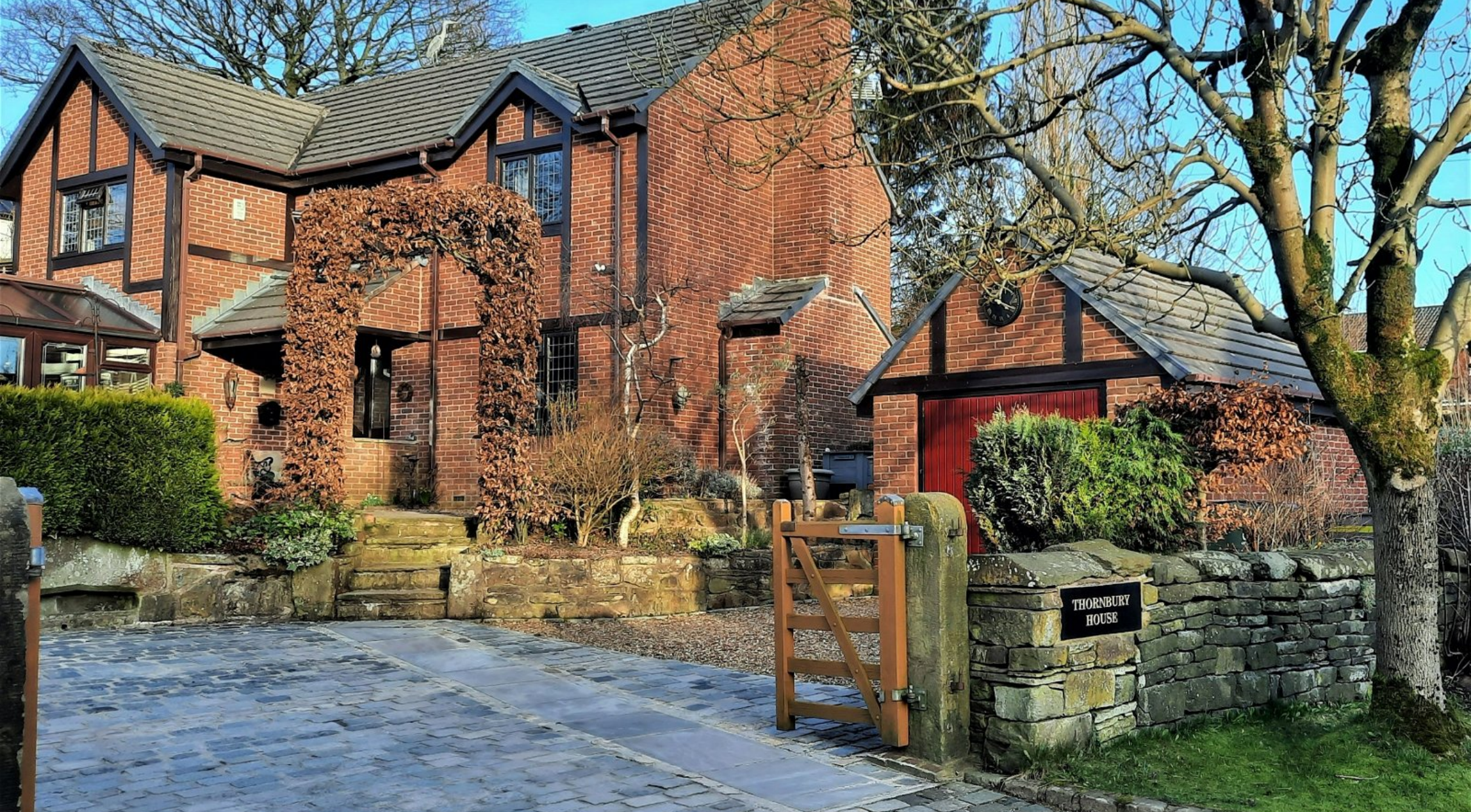
Thornbury House, Thorp, Royton