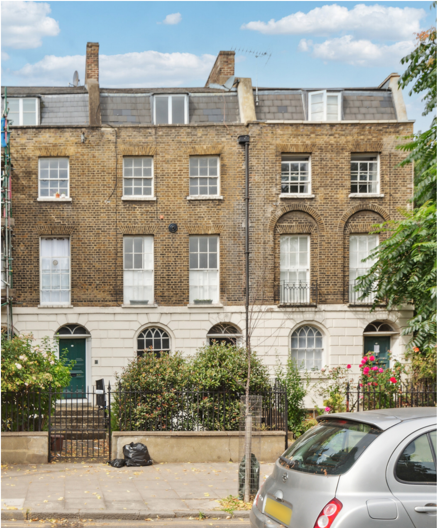
LIVERPOOL ROAD Islington N1