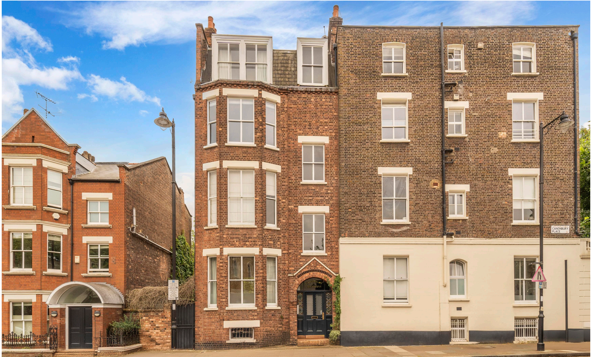
Canonbury Place, Islington, London NI