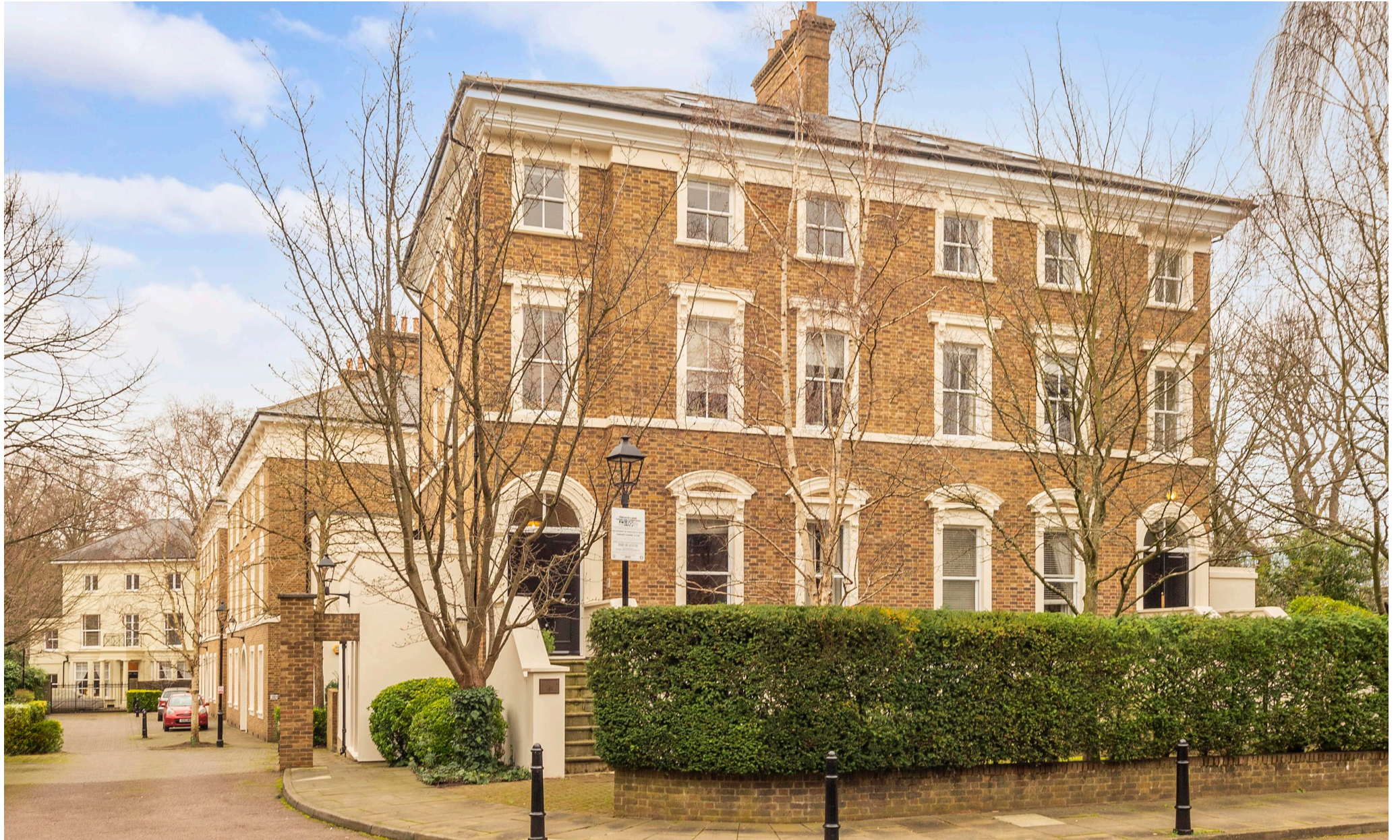
Cromwell House, Islington, London NI