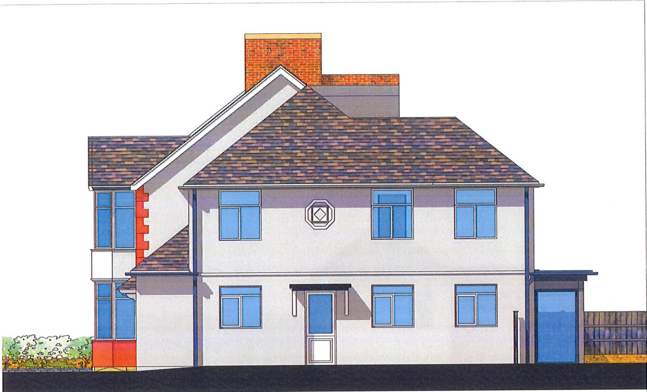
EAST (SIDE) ELEVATION