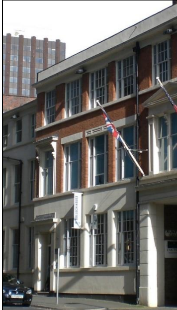
EXTERNAL & OFFICE