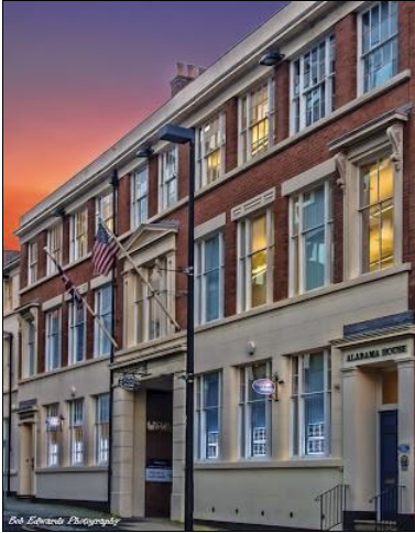
EXTERNAL & OFFICE