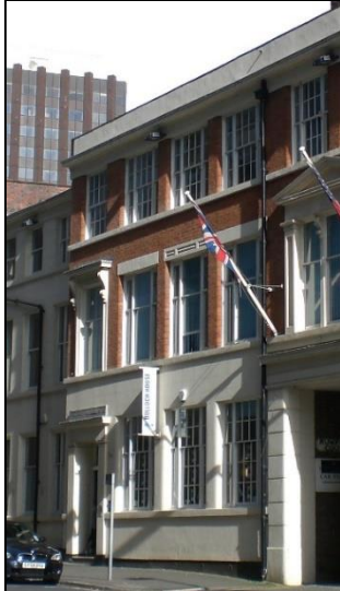
EXTERNAL & OFFICE