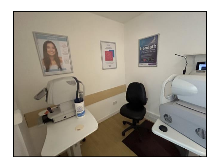
CLINIC ROOM 2