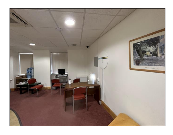
FIRST FLOOR FRONT ROOM