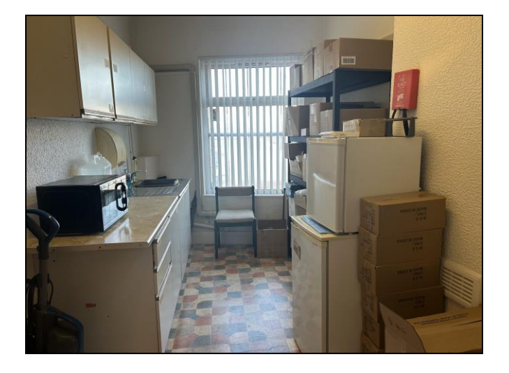
FIRST FLOOR KITCHEN