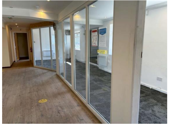
GROUND FLOOR FRONT OFFICE