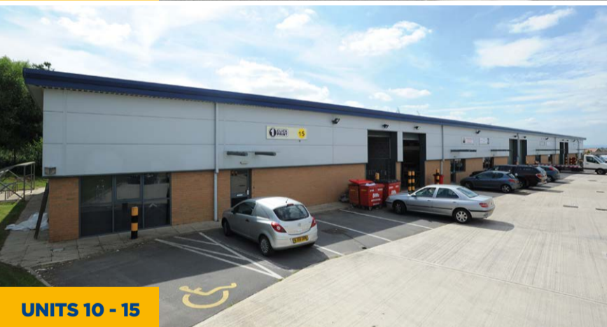
UNITS 10 - 15