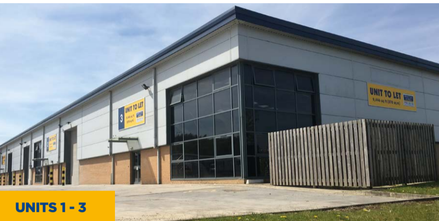
UNITS 1 - 3