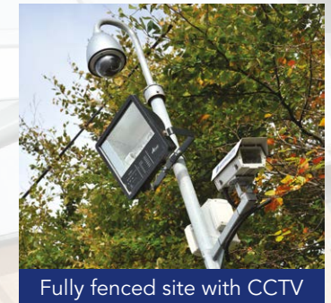
Fully fenced site with CCTV

MISREPRESENTATION ACT: Whittle Jones, Knight Frank & Ryden on behalf of proposing vendors or lessors and on their own behalf give notice that: (i) These particulars are set out as general information only for the assistance of intending purchasers or lessees. They do not constitute nor constitute part of an offer and will not be incorporated in any contract term; (ii) all descriptions, dimension, references to condition and necessary permissions for use and occupation, and other details are provided in good faith but without any liability of any kind on any proposing vendors or lessors. Any intending purchaser or lessee shall not rely on such information which is given on condition that any intending purchasers or lessors shall satisfy themselves by their own inspections or other enquiries about the property in all respects; (iii) no partner and no person employed by Whittle Jones, Knight Frank & Ryden has any authority to make any representation or give any warranty whatsoever in relation to this property whether on behalf of proposing vendors or lessors of Whittle Jones, Knight Frank & Ryden. Designed and Produced by Creativeworld. 01282 858200. March 2018.