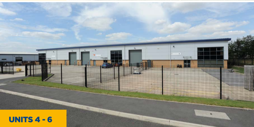
UNITS 4 - 6