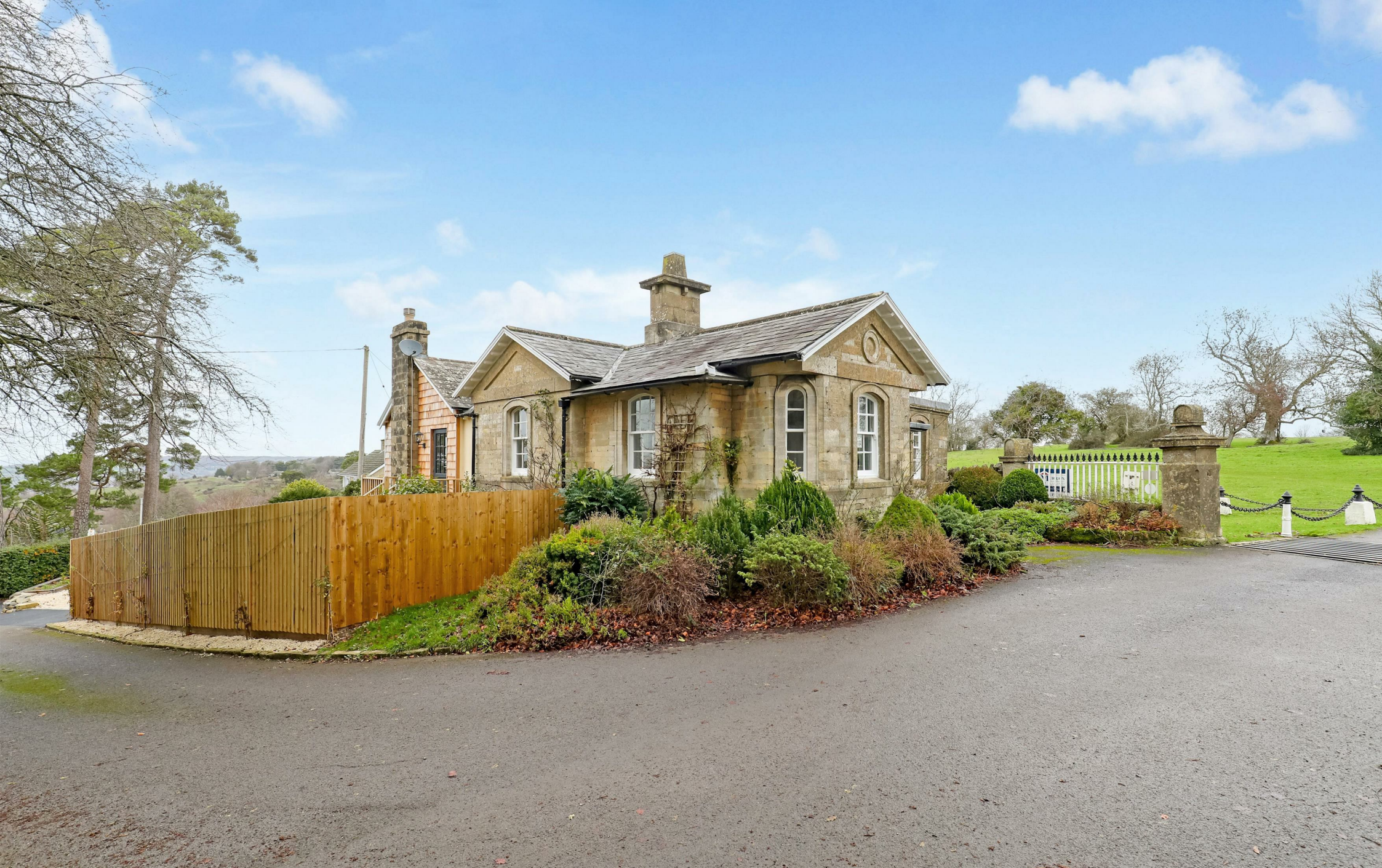
The Lodge, Moor Court . . . Rodborough Common