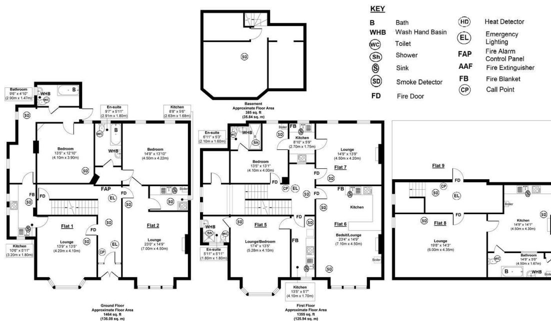
Illustration for identification purposes only. measurements are approximate, not to scale.