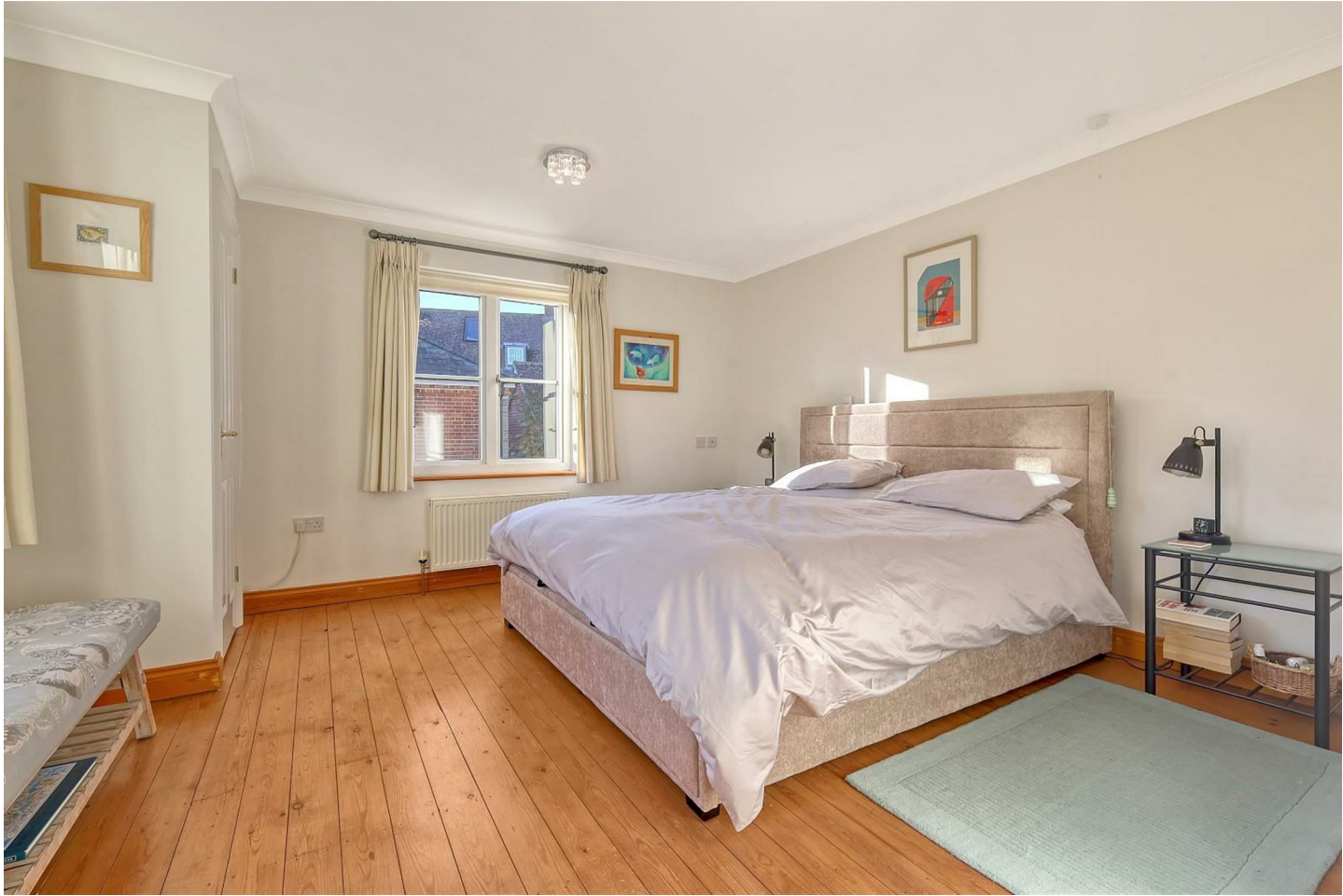
Principal Bedroom 17' x 13'1" (5.18m x 3.99m) UPVC double glazed windows to multiple aspects, built-in wardrobes, exposed floorboards, radiator, power points, T.V point, door to.