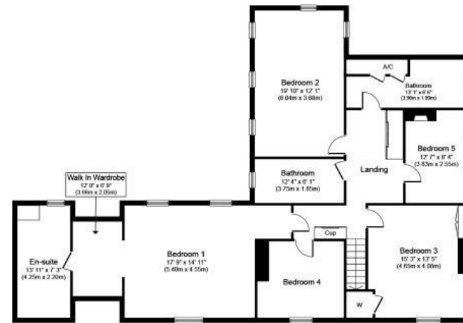
First Floor Approximate Floor Area 1,550 sq. ft. (144.0 sq. m.)

Whilst every attempt has been made to ensure the accuracy of the floor plan contained here, measurements of doors, windows, rooms and any other items are approximate and no responsibility is taken for any error, omission, or mis-statement. This plan is for illustrative purposes only and should be used as such by any prospective purchaser or tenant. The services, systems and appliances shown have not been tested and no guarantee as to their operability or efficiency can be given. Copyright V360 Ltd 2019 | www.houseviz.com