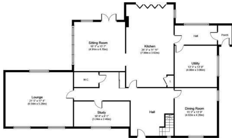
Ground Floor Approximate Floor Area 2,067 sq. ft. (192.0 sq. m.)