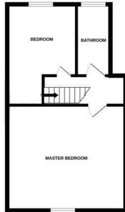
1ST FLOOR 422 sq.ft. (39.2 sq.m.) approx.