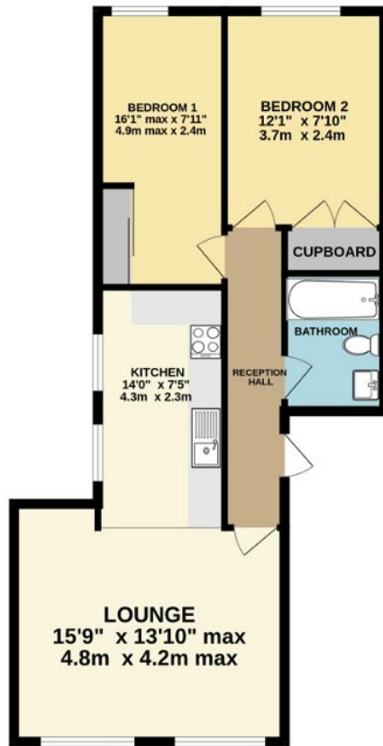
GROUND FLOOR - APARTMENT 2