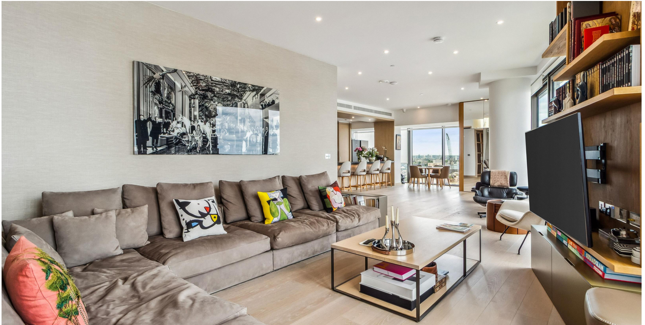
VIADUCT GARDENS London SW11