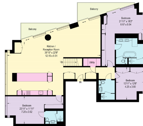
Twenty Second Floor