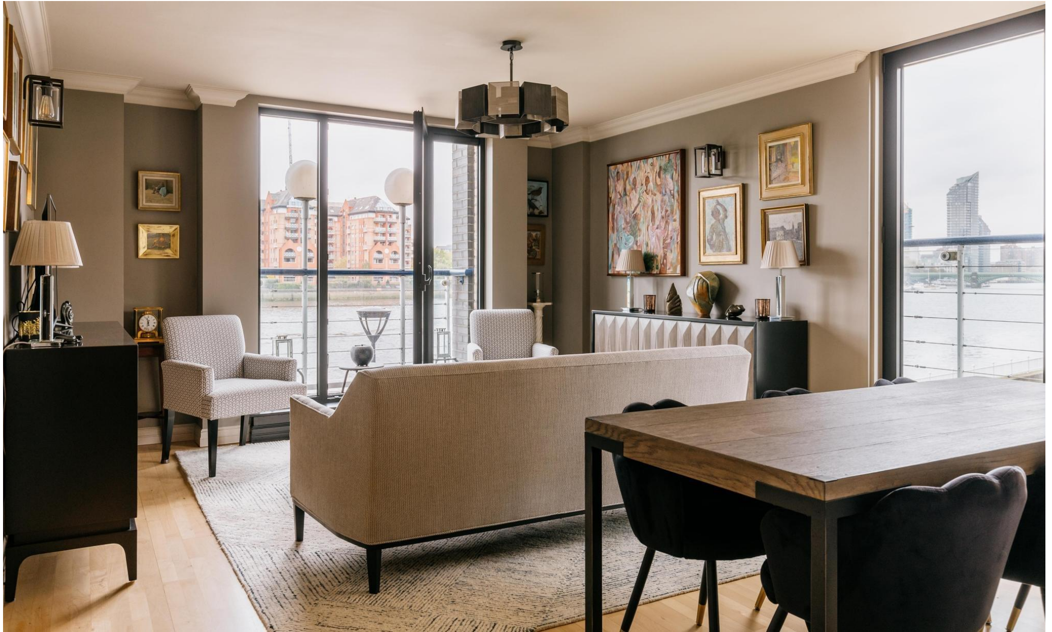
Molasses House, Clove Hitch Quay SW11