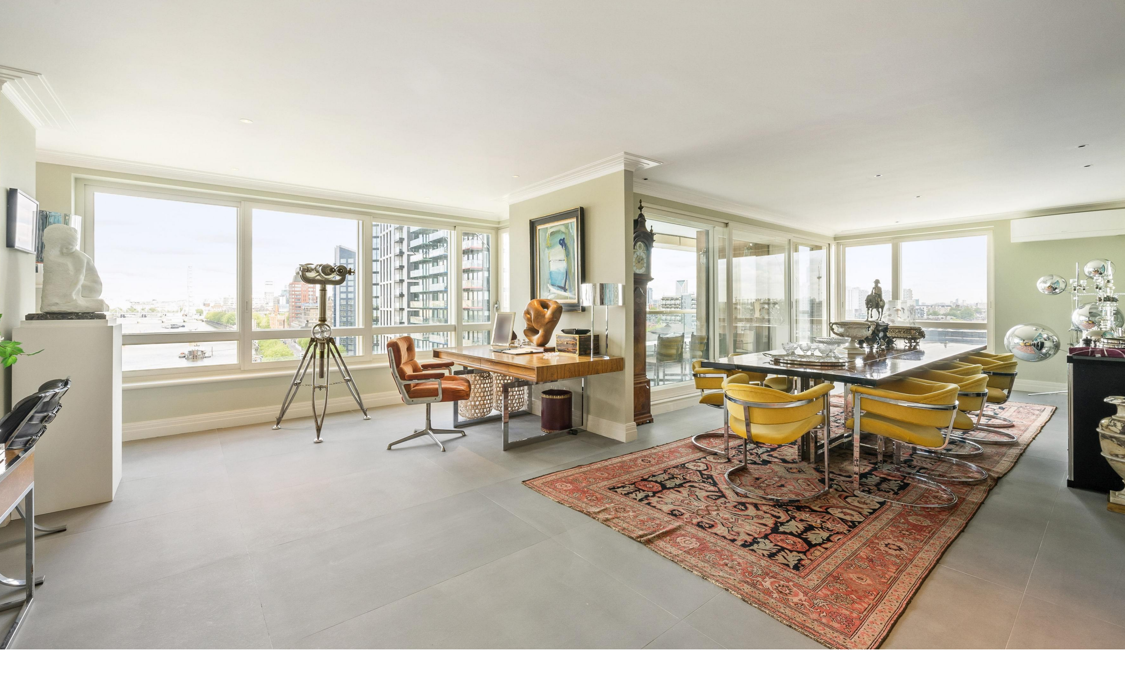
Peninsula Heights, Albert Embankment SE1