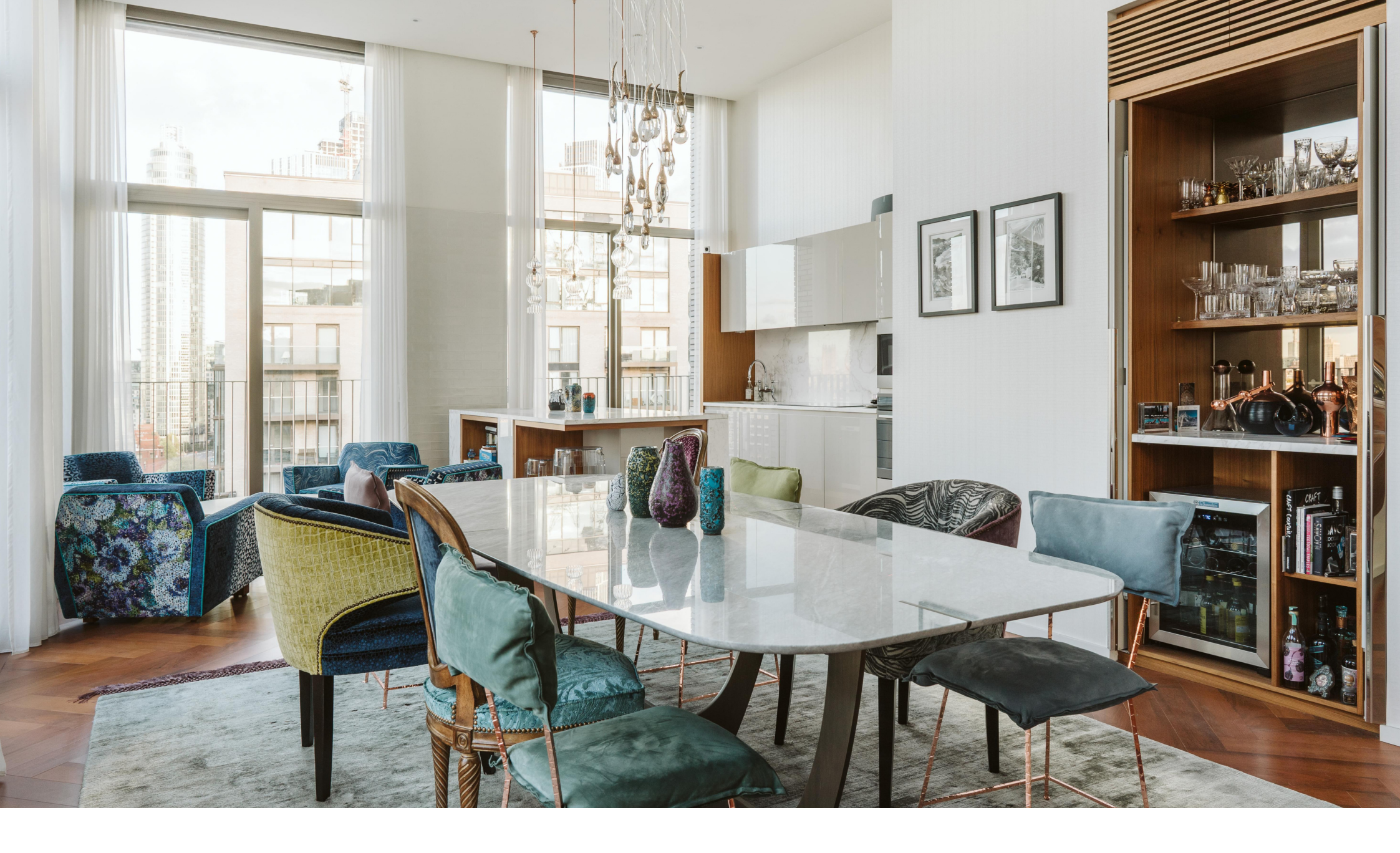
Capital Building, 8 New Union Square SW11