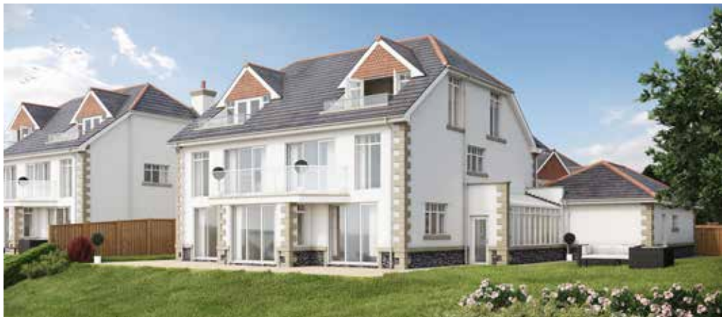
* Plans / Specifications are subject to change during the build process