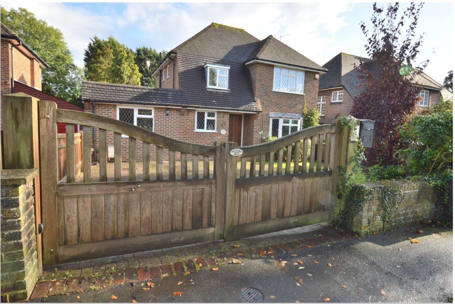
Spacious 3 bedroom detached house within a short walk to Merstham train station and local shops.