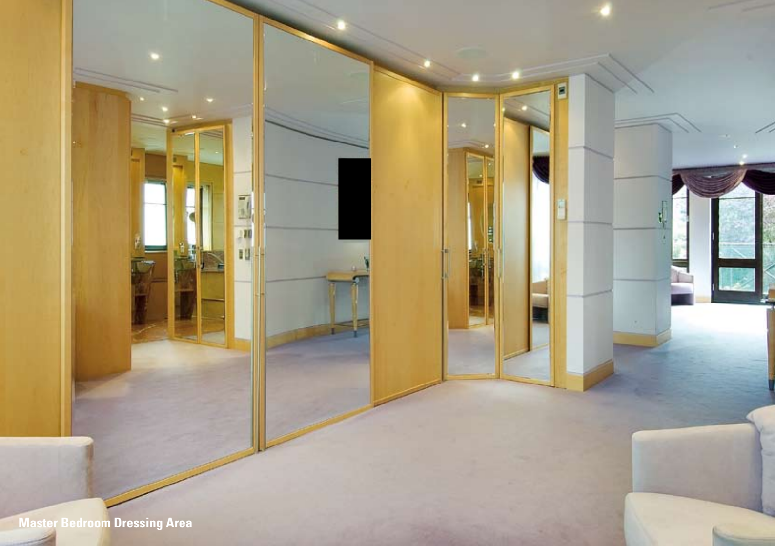
Master Bedroom Dressing Area