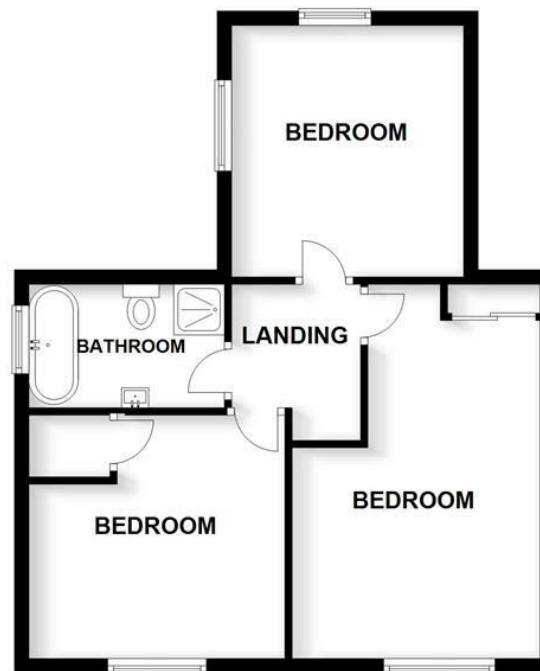
TOTAL AREA: APPROX. 1247.4 SQ. FEET

Plan produced by www.firstpropertieservices.co.uk . We accept no responsibility for any mistake or inaccuracy contained within the floorplan. The floorplan is provided as a guide and should be taken as an illustration only. The measurements, contents and positioning are approximations only and provided as a guidance tool and not an exact replication of the property. Plan produced using PlanUp.