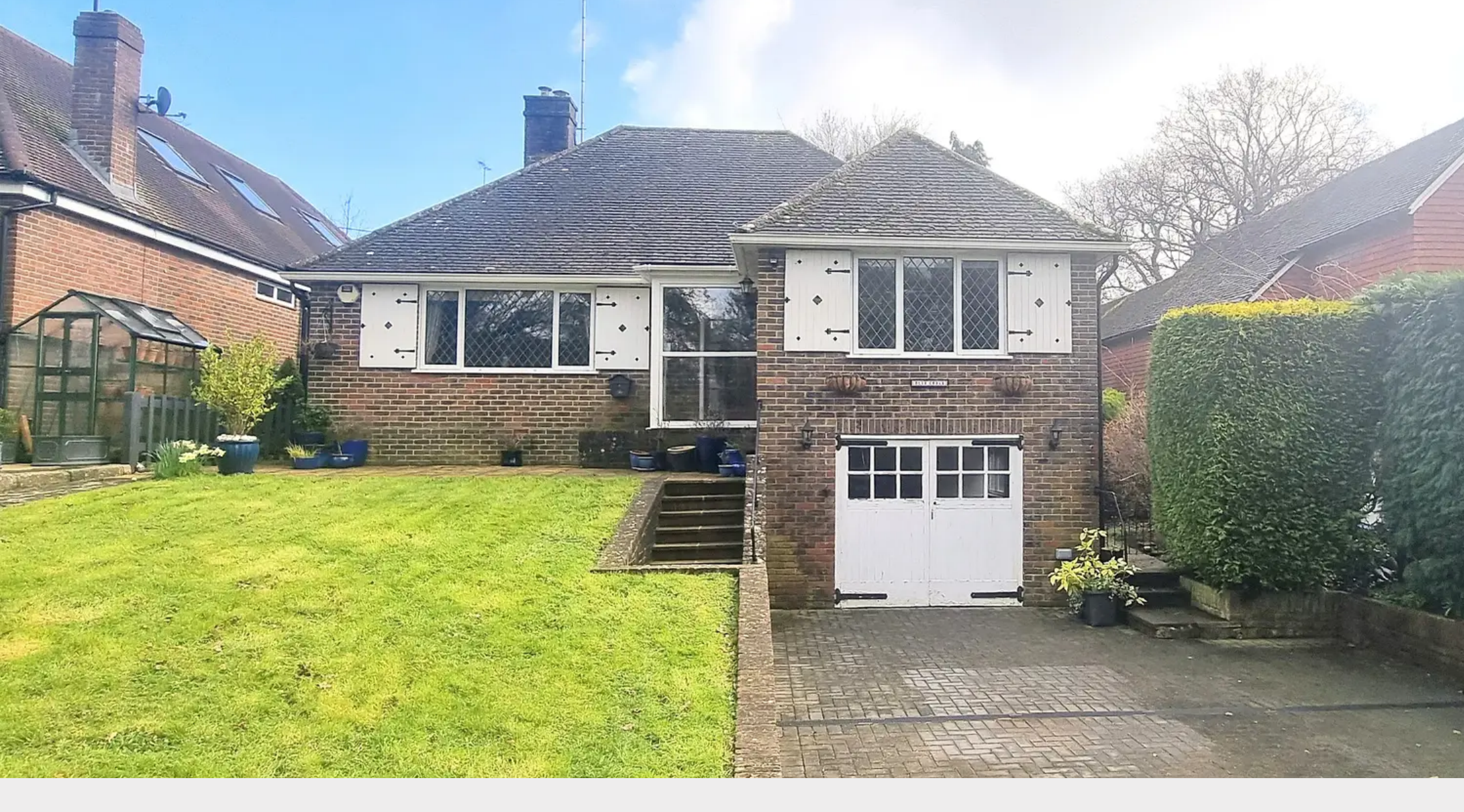
'Blue Cedar' Fairfield Close, Ardingly, RH17 6UH