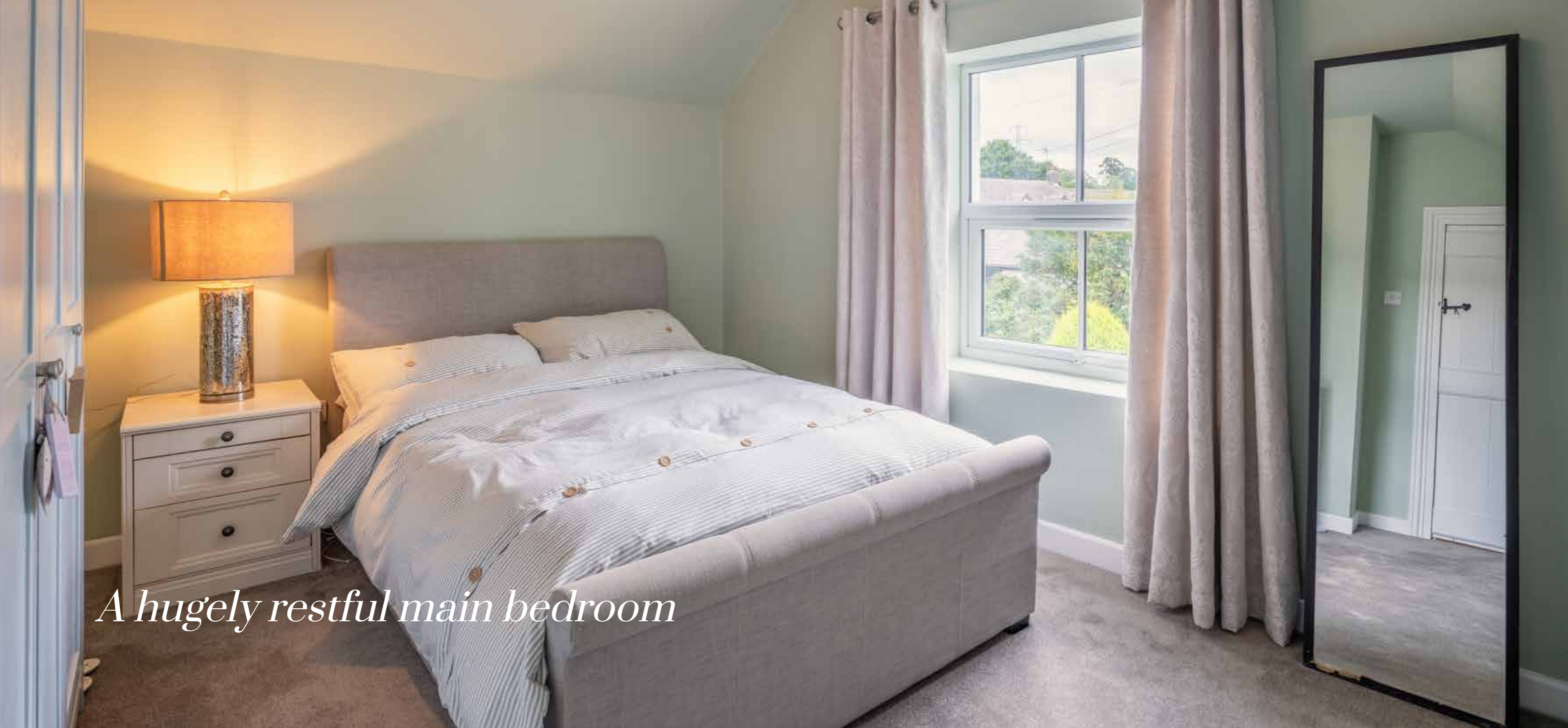
A hugely restful main bedroom