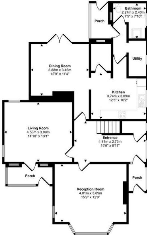
Ground Floor Approx 108 sq m / 1159 sq ft

Approx Gross Internal Area 193 sq m / 2079 sq ft