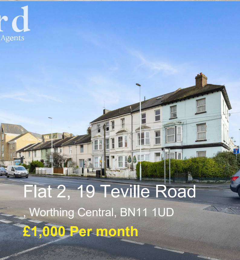
Flat 2, 19 Teville Road , Worthing Central, BN11 1UD £1,000 Per month