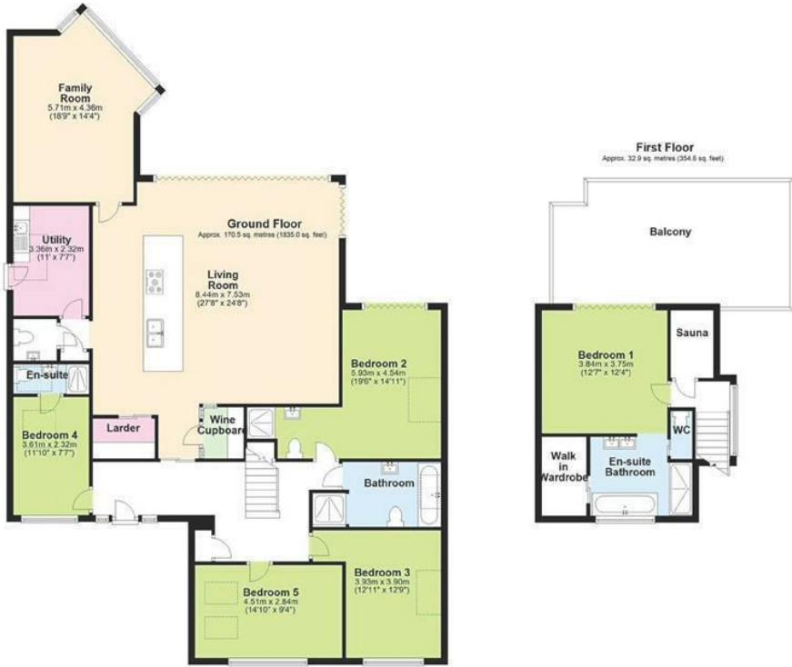
Ground floor and 1st floor total area approx 2189.6 sq. feet (203.4 sq.m.)