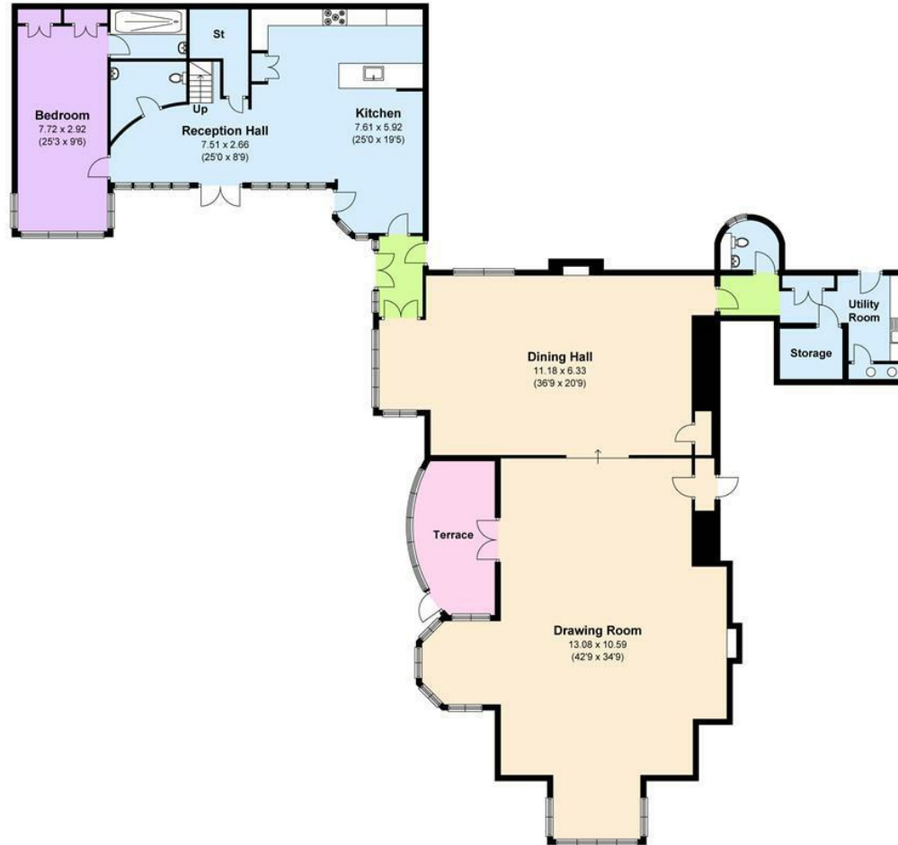
Ground Floor Approx. 271.32 sq. metres (2920.47 sq. feet)