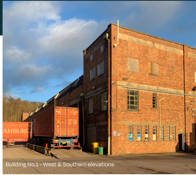
Building No.1 - West & Southern elevations

Historic industrial site re-invented for modern requirements. The site comprises logistics, industrial and office buildings.