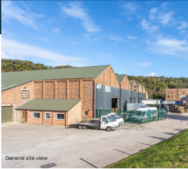
General site view

Availability: 40,415 sq ft Rental: £5.50 per sq ft