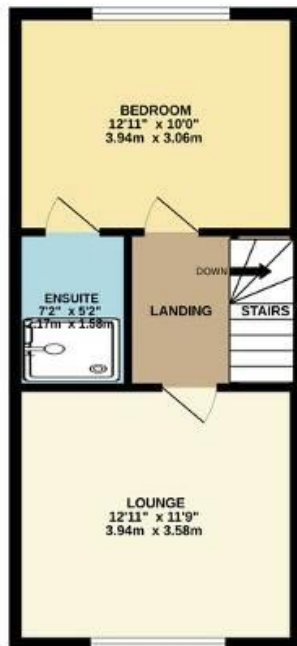
1ST FLOOR 374 sq.ft. (34.8 sq.m.) approx.