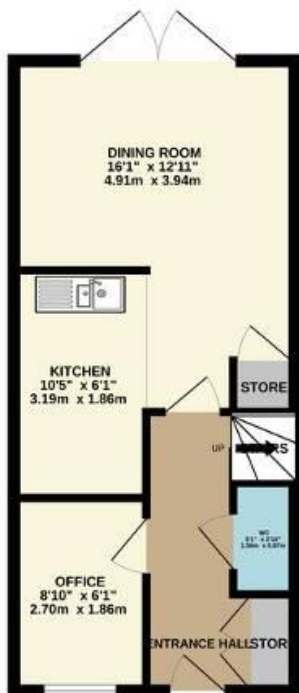
GROUND FLOOR 374 sq.ft. (34.8 sq.m.) approx.