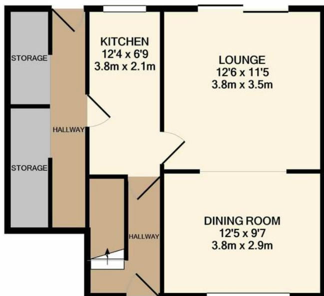
GROUND FLOOR APPROX. FLOOR AREA 504 SQ.FT. (46.8 SQ.M.)