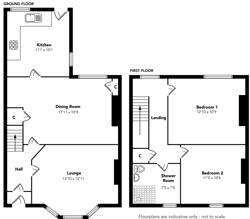
Floorplans are indicative only - not to scale Produced by Plushplans

Whilst we endeavour to make these particulars as accurate as possible, they do not form part of any contract of offer, nor are they guaranteed. Measurements are approximate and in most cases are taken with a digital/ sonic-measuring device and are taken to the widest point. We have not tested the electricity, gas or water services or any appliances. Photographs are reproduced for general information and it must not be inferred that any item is included for sale with the property. If there is any part of this that you find misleading or simply wish clarification on any point, please contact our office immediately when we will endeavour to assist you in any way possible.