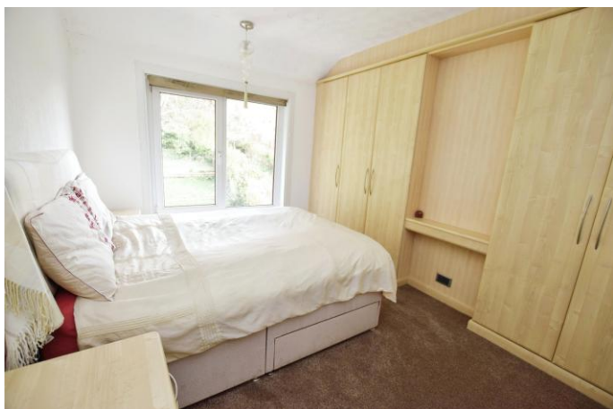
Bedroom Two 11' 2" x 9' 8" (3.4m x 2.94m) uPVC double glazed window to the front aspect.