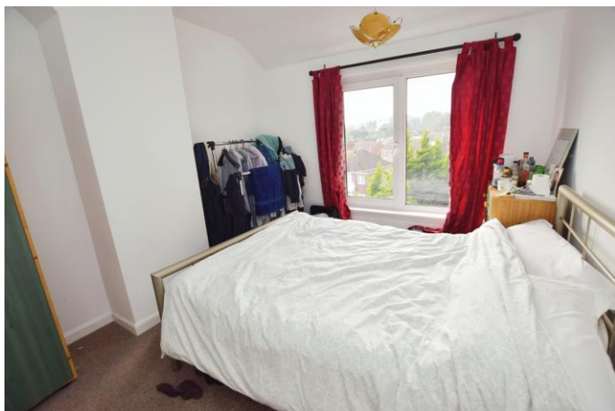
Bedroom Three 7' 11" x 7' 8" (2.41m x 2.34m) uPVC double glazed window to the front aspect.