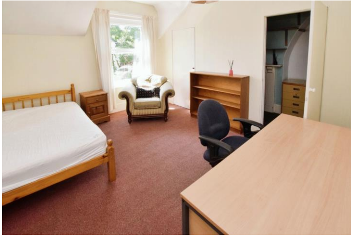
Bedroom Six 12' 11" x 10' 9" (3.937m x 3.283m) Rear aspect uPVC double glazed window. Built in wardrobe with hanging space and shelving, feature fireplace, pedestal wash hand basin with tiled splashback, radiator.